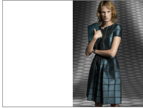
Jacket UMG27T Dress UMA18T Bag Y5F000