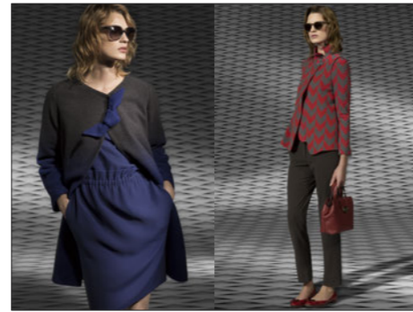
Jersey Coat 6XML51 Dress UMA13T Eyewear AR 8061 Jersey Jacket 6XMG72 Pants UMP19T Shoes X5V002 Bag Y5A011 Eyewear AR 8060