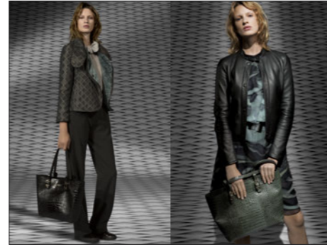
Caban UMB78T Top UMH10T Pants UMP32T Shoes X5J008 Bag Y5D007 Leather Jacket UMG02P Dress UMA30T Bag Y5D007