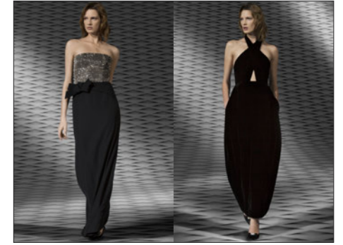
Embroidered Dress UMA85R Shoes X5F012 Dress UMA50T Shoes X5E024