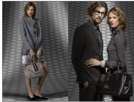
Knit Blouson 6XMK01 Dress UMA26T Shoes X5A005 Bag Y5A015 Jersey Jacket 6XMG70 Pants UMP22T Bag Y5A012 Lady Bracialet 510127