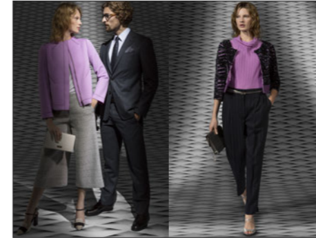
Jersey Knit 6XMM50 Jersey Knit 6XMB50 Pants UMP34T Shoes X5F013 Bag Y5F000 Embroidered Jacket UMG85R Knit 6XMM22 Pants UMP18T Shoes X5P022 Bag Y5B002 Belt Y5I000